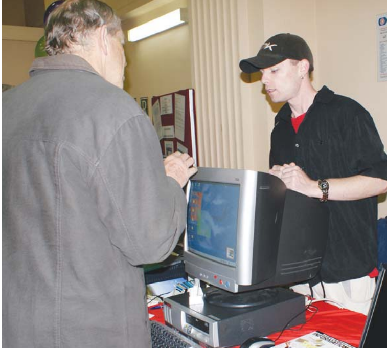
Above - looking for a recycled computer?