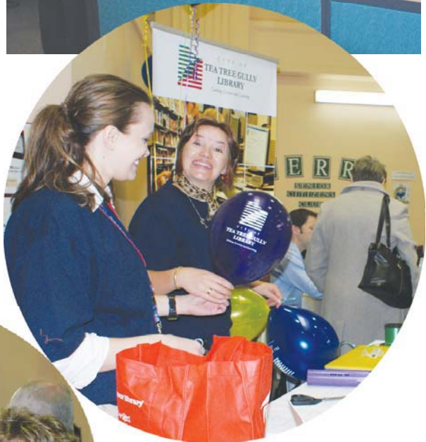
Above: City of Tea Tree Gully Library representatives